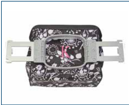
4" x 4" Hoop

The Alliance comes with six embroidery hoops, ranging from the nimble 1-1/2" x 1-3/4" hoop all the way up to 8" x 8".