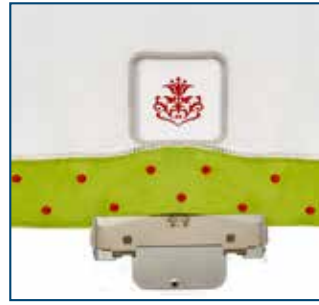
2" x 2" Hoop