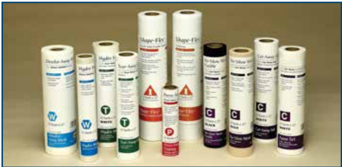
Baby Lock Stabilizer