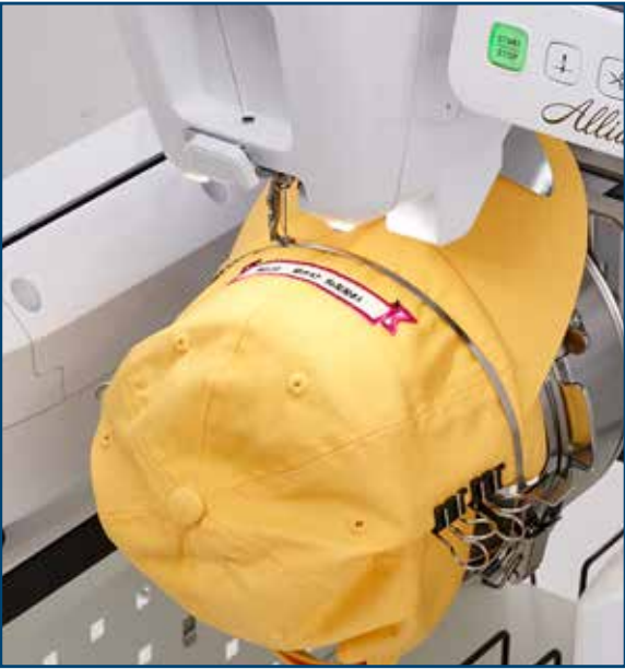
Advanced Cap Frame Set