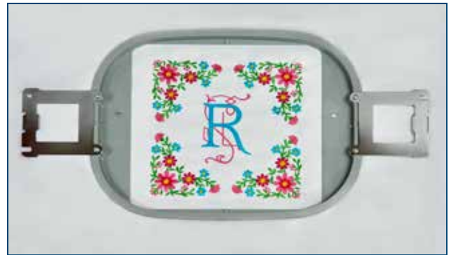
8" x 8" Hoop