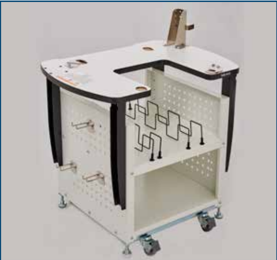
Height Adjustable Stand