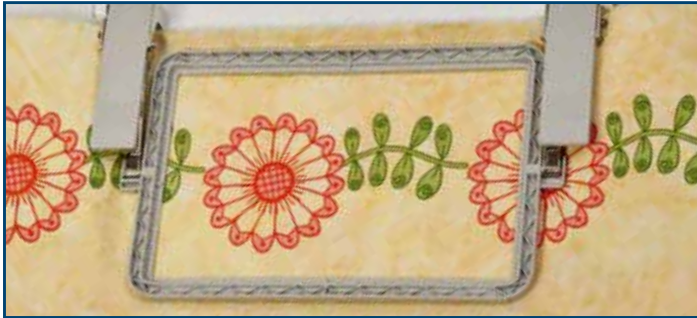
Continuous Border Hoop - 4" x 11-3/4"