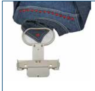
1-15/16" x 2-15/16" Hoop