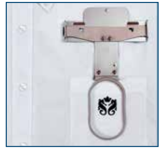
1-5/8" x 2-3/4" Hoop