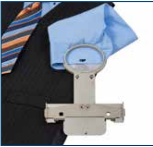
1-1/2" x 1-3/4" Hoop